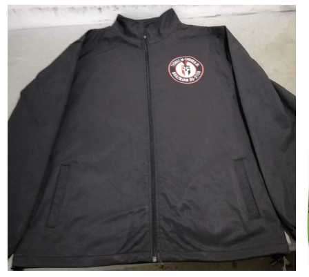
JACKET STYLE: Full zipper, higher collar, front pockets, thicker fabric.

EACH ORDER MUST HAVE A FORM. PLEASE DO NOT ORDER MULTIPLE JACKETS OR MULTIPLE PANTS ON THE SAME ORDER FORM.