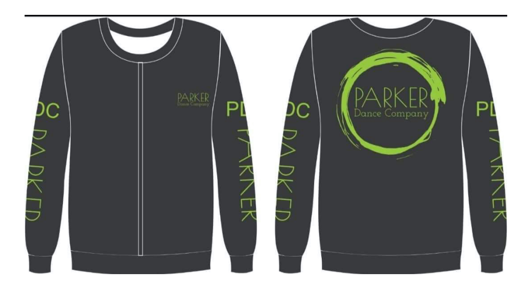
JACKET: Picture of Option TWO.